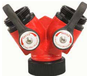
Style 505, 506 Forestry Wyes