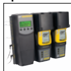
MicroDock II compatible