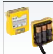
Always ready when you are