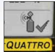
Simple, visual compliance